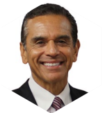
Former Mayor Antonio Villaraigosa

Infrastructure Advisor to the State of California