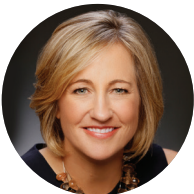
Dee Dee Myers Senior Advisor, Governor Gavin Newsom Director, Governor's Office of Business and Economic Development